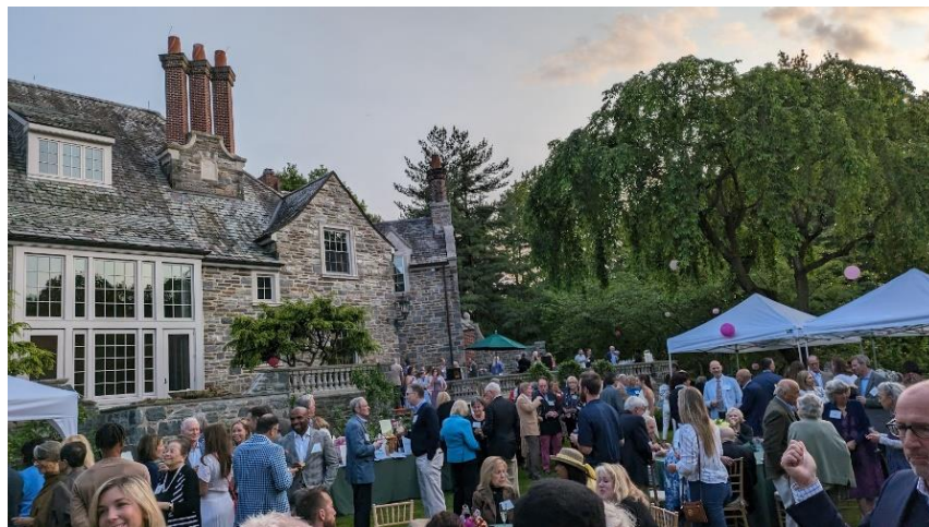
The Lower Merion Conservancy hosts an annual gala to raise funds for its important programming.

The firm has had a long-standing relationship with the Lower Merion Conservancy and involvement with its board. The Conservancy works to protect open space, preserve historic resources, and conserve the local watershed in Lower Merion Township, which includes our firm's offices in Bala Cynwyd. What drew me to the Conservancy was my interest in preserving open space. I currently serve on the Conservancy's Executive Committee, and I chair its Sustainability Committee which focuses on entering into conservation easements with Lower Merion residents and promoting sustainability practices within Lower Merion. As an environmental attorney, I am able to provide a solid voice on the board to help guide projects and navigate complex issues.