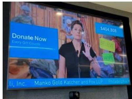
Manko, Gold, Katcher & Fox is a proud sponsor of Habitat for Humanity Philadelphia’s Building Hope Virtual Lunch-In.