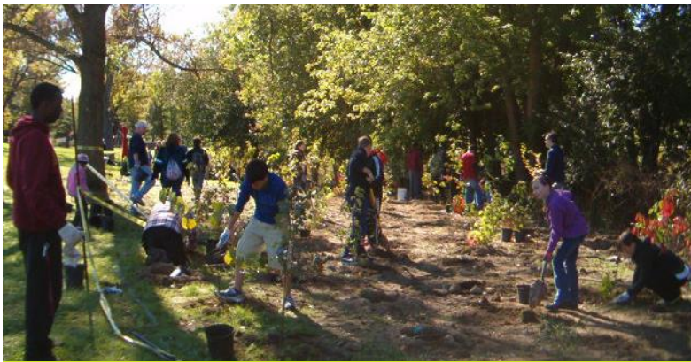
Students from Abington Junior High School plant over 300 native trees, shrubs, and wildflowers for Green Apple Day of Service 2012.